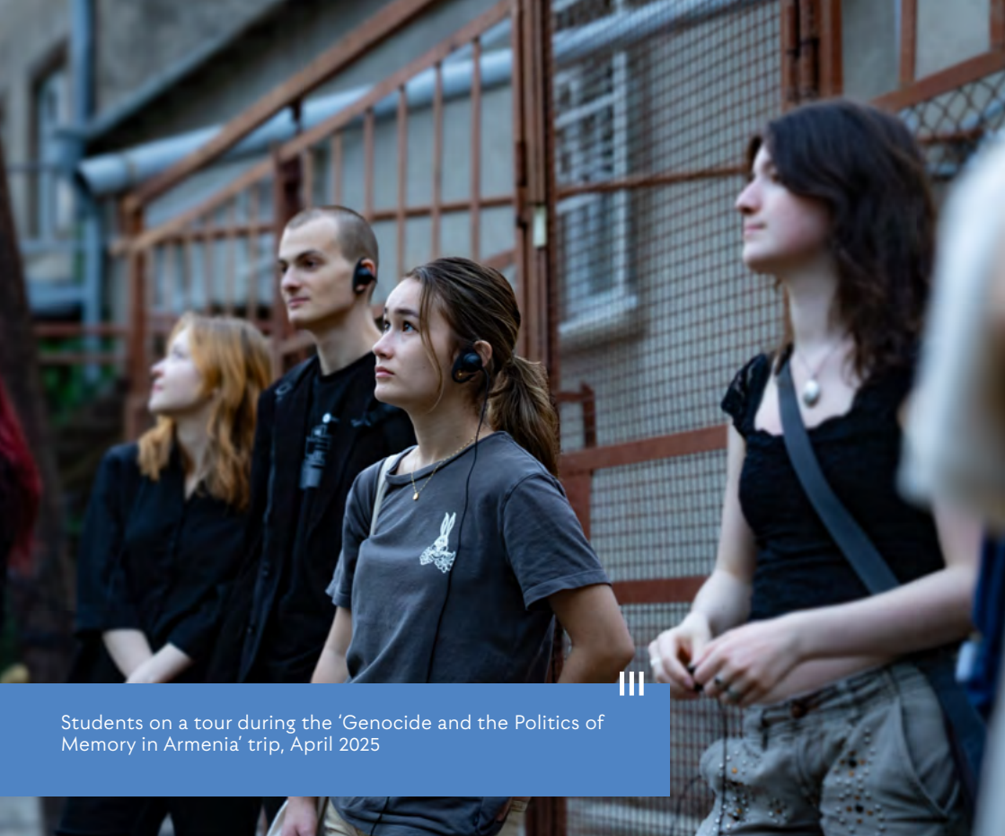
Students on a tour during the 'Genocide and the Politics of Memory in Armenia' trip, April 2025