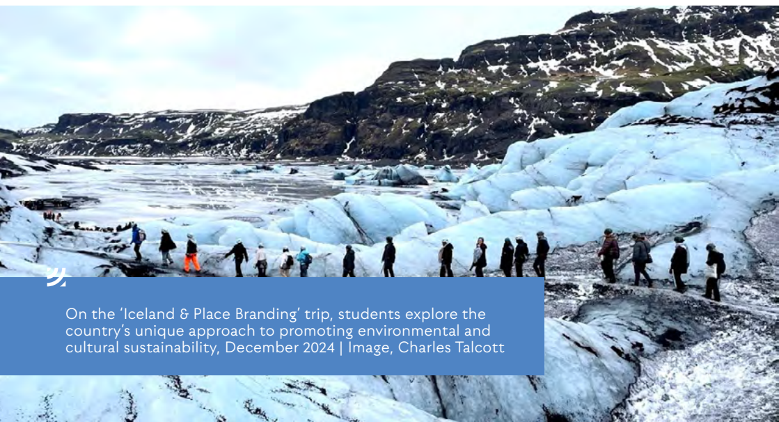
On the 'Iceland & Place Branding' trip, students explore the country's unique approach to promoting environmental and cultural sustainability, December 2024