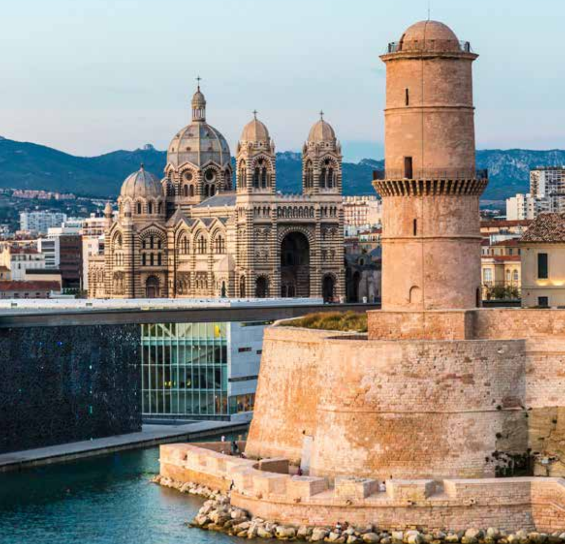
MUCEM and Cathédrale de la Major in Marseille