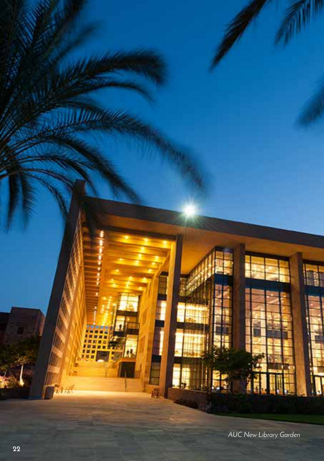
AUC New Library Garden